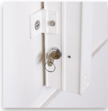
Lock for use as Inspection Ladder